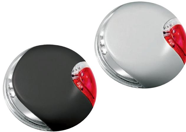
LED Lighting System rechargeable via USB