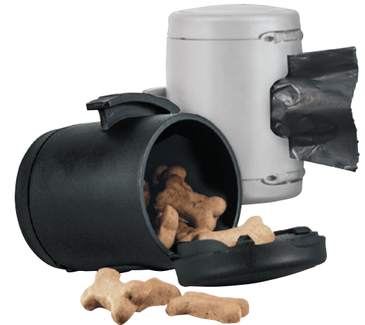
Multi Box stores treats or waste bags